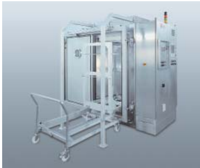
Vacuum heating and drying oven – Microwave-heated design available as option