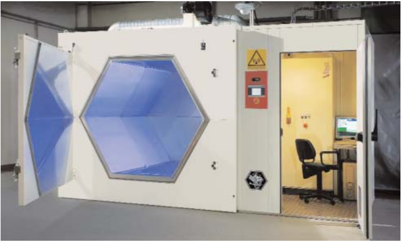
VHM 180/200 HEPHAISTOS

...when used in Research, Development and Production