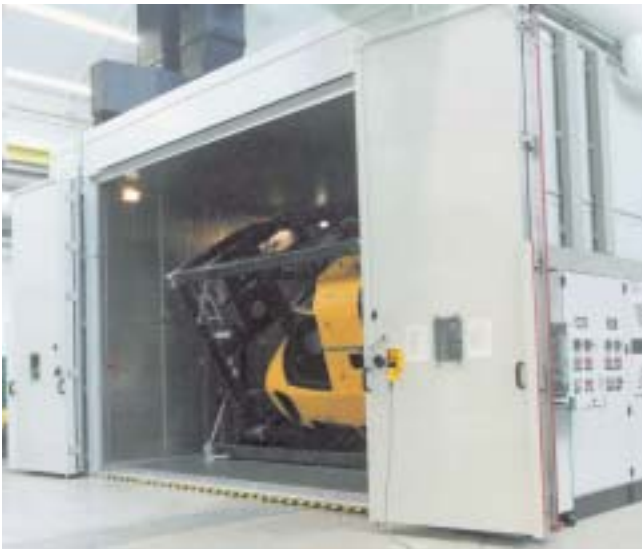
Recirculation air tempering oven with mobile rotating frame for CFRP helicopter cockpits