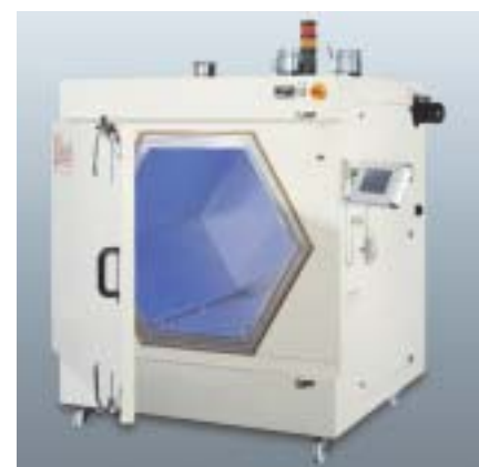
VHM 100/100 HEPHAISTOS